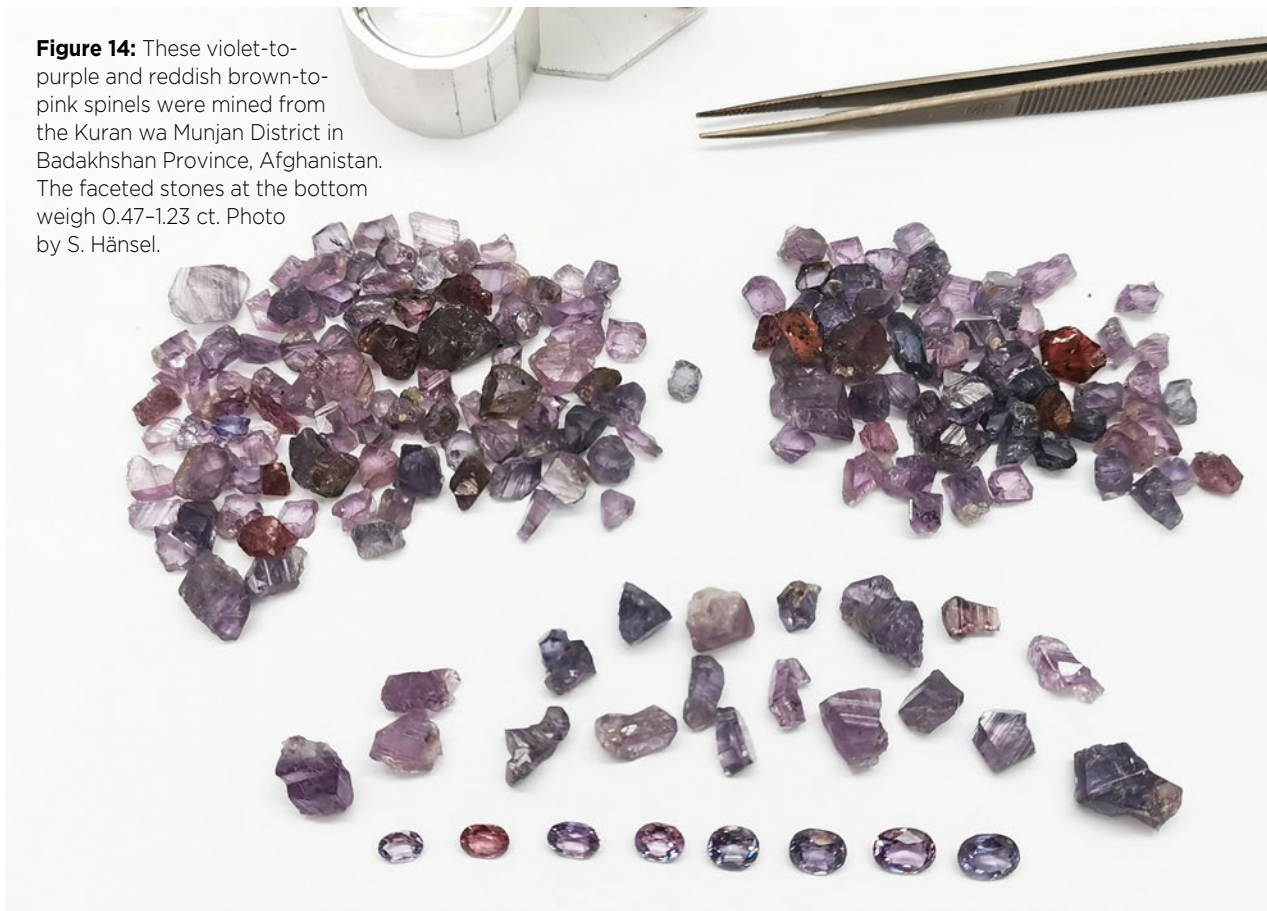
Figure 14: These violet-to-purple and reddish brown-to-pink spinels were mined from the Kuran wa Munjan District in Badakhshan Province, Afghanistan. The faceted stones at the bottom weigh 0.47–1.23 ct.